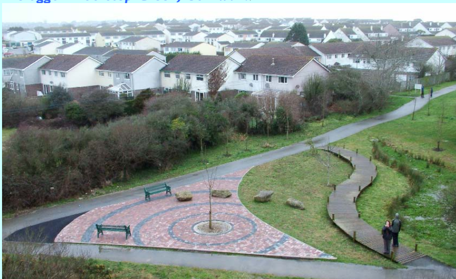
See story above.

View more photos of Doorstep Greens on the 'Resources' are of our website .