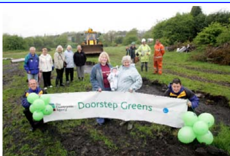
Hawkesbury Village Green

The following Doorstep Green project was completed during July